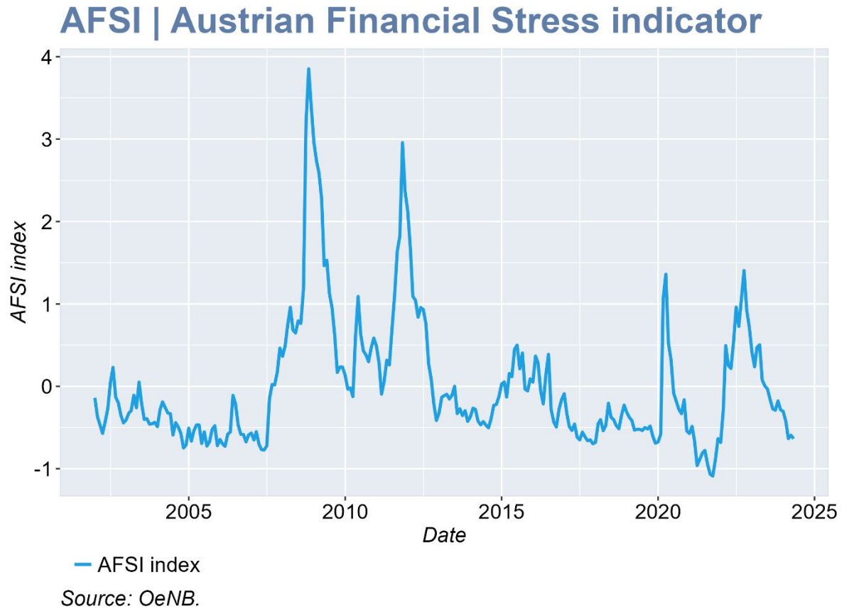
Chart 2: Austrian Financial Stress Indicator

Note: The Austrian Financial Stress Indicator (AFSI) is a composite indicator which combines adverse developments on the equity market, the bond market and the money market. High AFSI values signal times of heightened instability; low AFSI values imply mispricing risks.